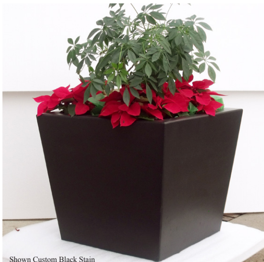
Shown Custom Black Stain

CPAS2828 Square Planter 28" L x 24"H x 28"W 600 Lbs