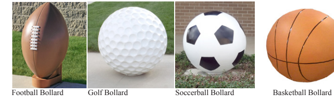
Football Bollard Golf Bollard Soccerball Bollard Basketball Bollard