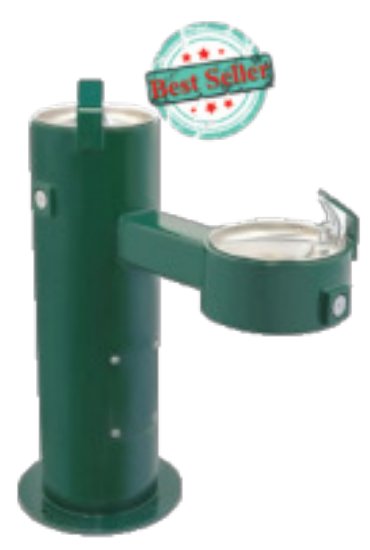
Dual-Height Meets multiple needs.

KP57SDF Standard 155 Lbs $ 2,775.00 KP57SDFFP Freeze proof 185 Lbs $ 4,156.00