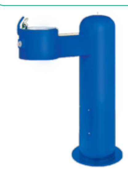
ADA Fountain Domed cylinder type.

KP53SWPF Standard 140 Lbs $ 2,804.00 KP53SWPFFP Freeze proof 170 Lbs $ 4,162.00