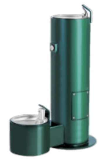
Cylinder + Pet Perfect near walking trails.

KP53SWPF Standard 140 Lbs $ 2,804.00 KP53SWPFFP Freeze proof 170 Lbs $ 4,162.00