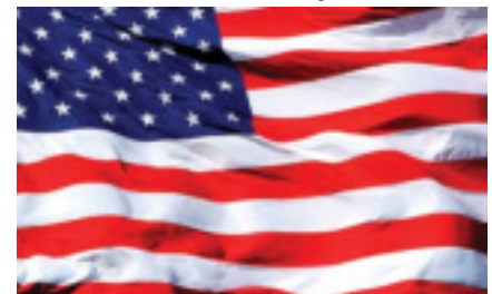
"Custom Flags Available - Please Inquire"