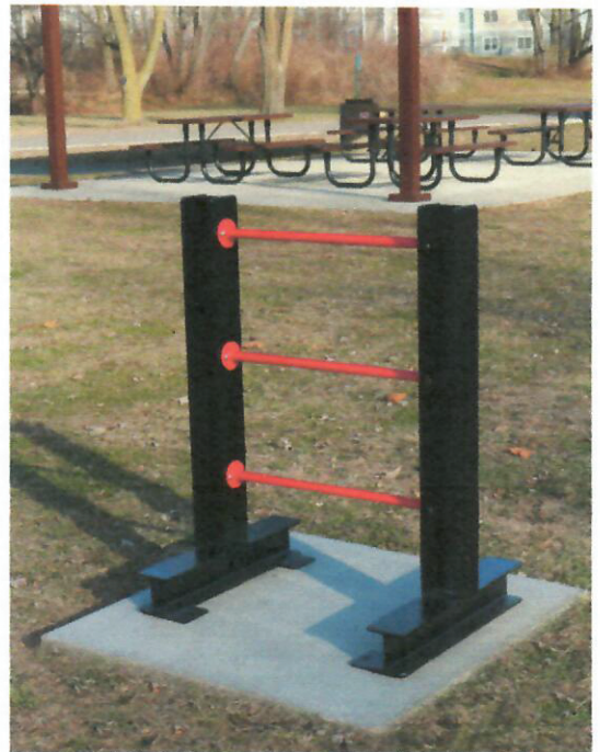
Shown with red rungs