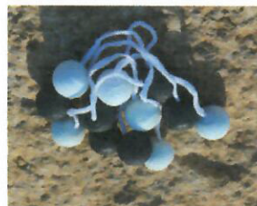
Bolas are optional and available in many colors.