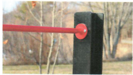
Close up view showing Heavy Duty I beam and rung.